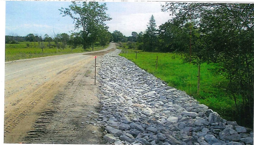
Fairfield, VT After