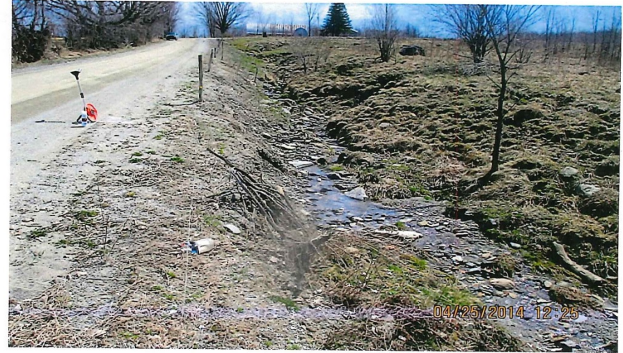
Fairfield, VT Before